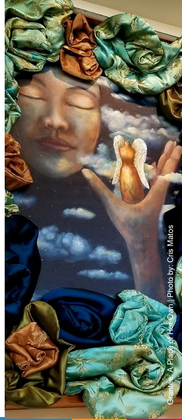
Grantee: A Place of Her Own